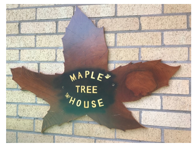
STATEMENT OF PURPOSE